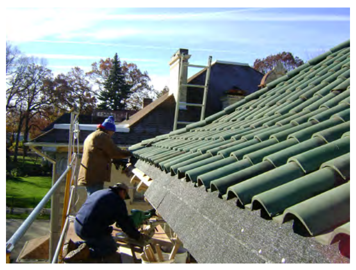
ABOVE : Roofers found salvaged green roof tiles to replace broken or damaged ones.