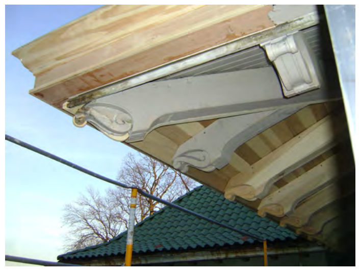
ABOVE : Nate's grandpa recreated the rafter tails from originals saved from the demolition as a pattern.