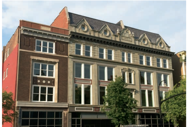
Above: Artspace Hamilton in the Mehrum-Lindley Block after transformation. Below: Mehrum-Lindley Block before transformation.