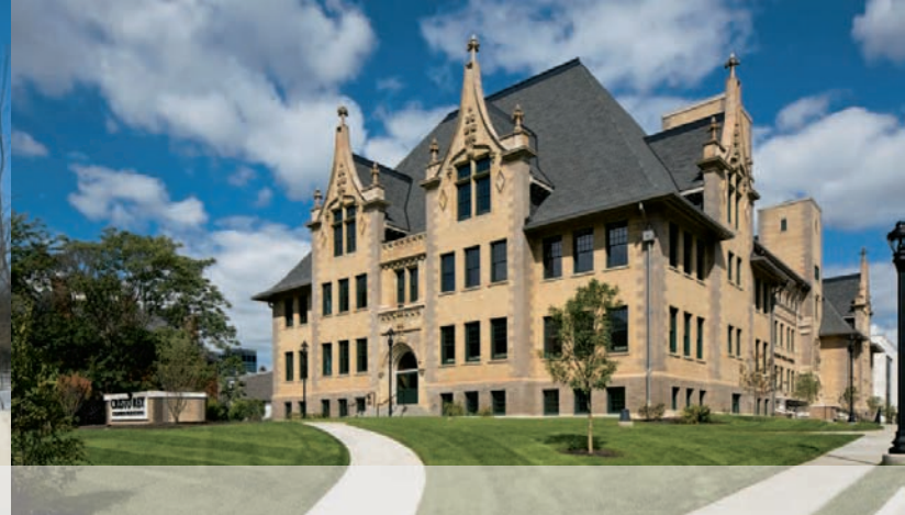
Left: Stewart Elementary School. Right: Cristo Rey High School.