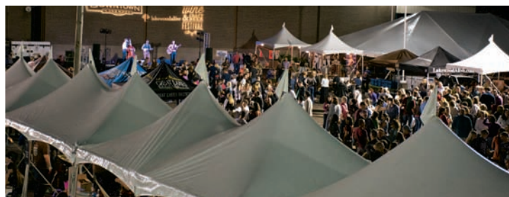
The Lakewood Wine and Beer Fest in downtown Lakewood.

In 2014, LakewoodAlive and Downtown Lakewood Business Alliance hosted the 2nd annual "Lakewood Wine & Craft Beer Festival." The unique outdoor, two-story wine and beer festival was sponsored by BEER ENGINE. Lakewood Wine & Craft Beer is a Lakewood event conceived out of the desire to bring funds to the program to invest in dream list items the city could not afford. With the help of 200 volunteers and 20+ committee members, Lakewood Wine & Craft Beer Festival brought in $25,000, selling out the event to a packed 2,000 attendees.