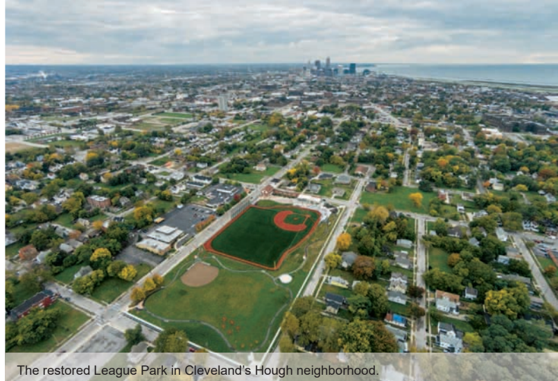
The restored League Park in Cleveland's Hough neighborhood.

Over the years, disinvestment in the neighborhood slowly eroded this once bustling landmark. The park had been fenced off from the neighborhood and sat in a state of dilapidation for decades. The $6.5 million project restored pieces of the renowned heritage ballpark structure. The restoration recaptures a significant piece of baseball history and creates a fresh foundation for the revitalization of Cleveland's Hough neighborhood.