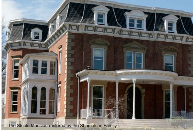
The Steele Mansion restored by the Shamakian Family.