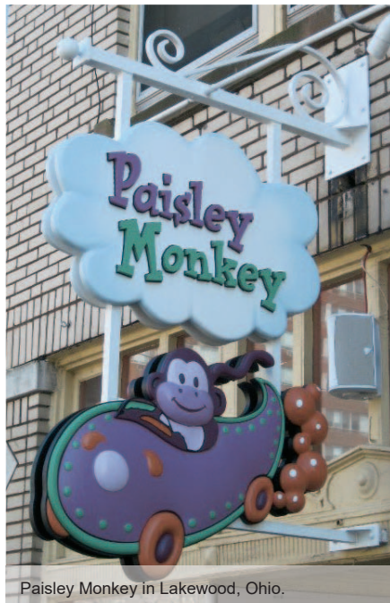
Paisley Monkey in Lakewood, Ohio.

In 2010 Paisley Monkey, initially an online shop for children's clothing and gifts, opened its doors in downtown Lakewood in a 350 square foot storefront space located on the side block of a bank building with no neighboring retail businesses. Known for their excellent customer service,