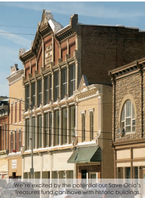
We're excited by the potential our Save Ohio's Treasures fund can have with historic buildings.

It should come as no surprise that we came to the realization years ago that Ohio needed a dedicated brick and mortar fund that could be used when historic buildings in Ohio were at risk of demolition. While we knew a "Save Ohio's