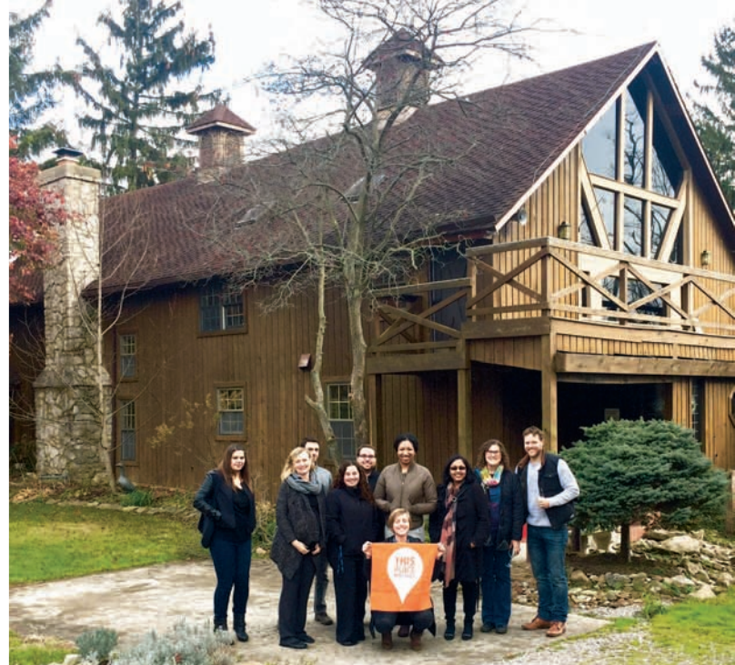
The Young Ohio Preservationists at the Rockmill Brewery in Lancaster, Ohio.

We want to work to become a resource for you, the people that care about preservation in Ohio. In addition to advocacy, we are pleased to announce YOP will be launching an emerging professional session during Heritage