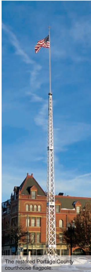
The restored Portage County courthouse flagpole.

Ravenna Township was already struggling with budget concerns when they realized that the landmark 120 year old flagpole in front of the Portage County courthouse was in need of serious restoration work. Decades of deferred maintenance took its toll and there was concern over the liability posed by a 150' deteriorated structure; the Township trustees felt that they had no choice but to demolish it and sell it for scrap. Citizens recognized the cultural significance of the flagpole and banded together to save it. The flagpole project has been highly visible "sparkplug," igniting interest in Ravenna's architectural resources.