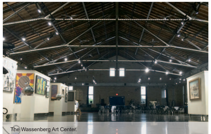
The Wassenberg Art Center.

In the fall of 2012, the art center identified the vacant former National Guard Armory, at the south entrance to downtown Van Wert, as an ideal future home for the center. The property was under contract with a discount dollar store, and