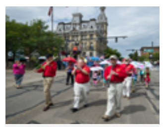
New Orleans-style parade at the Wooster Arts Jazz Fest

partnership plans for an infill project of condominiums and retail. D5L Liquor License: state legislation initiated by Main Street Wooster. A milestone for economic development of entertainment and dining in small Ohio downtowns. A local developer purchases downtown buildings for renovation; retail and restaurants.