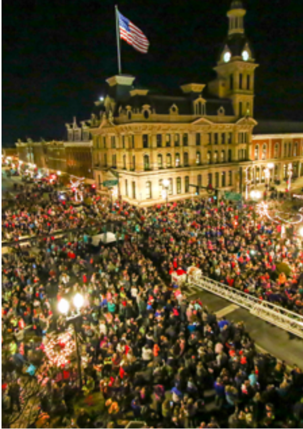
Window Wonderland 2017, the culmination of 30 years! People, People!

Main Street Wooster celebrating 30 years of a continuous program. City of Wooster creates two Welcome to Downtown Wooster major entries. City of Wooster completes wayfinding signage in the downtown.