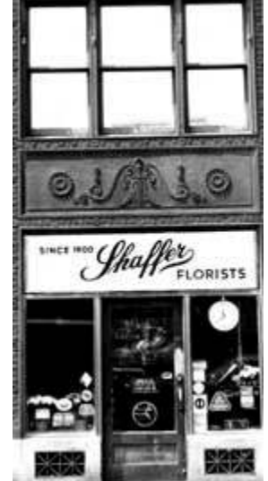
This finely detailed bronze storefront is typical of many constructed during the 1920s. The original grilles, spandrel panel and windows are all intact.

Copper --a nonmagnetic, corrosion-resistant, malleable metal, initially reddish-brown but when exposed to the atmosphere tur