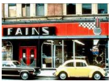
This 1930s Moderne storefront has gained significance over time and should be preserved.

A bewildering number of proprietary products also appeared during this period, many of which went into storefronts including Aklo, Vitrolux, Vitrolite, and Extrudalite. Highly colored and heavily patterned marble was a popular material for the more expensive storefronts of this period. Many experiments were made with recessed entries, floating display islands, and curved glass. The utilization of neon lighting further transformed store signs into elaborate flashing and blinking creations. During this period design elements were simplified and streamlined; transom and signboard were often combined. Signs utilized typefaces for the period, including such stylized