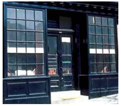
This cast iron storefront from the late 19th century has been well maintained over the years.

Commercial establishments of the 18th and early 19th centuries were frequently located on the ground floor of buildings and, with their residentially scaled windows and doors, were often indistinguishable from surrounding houses. In some cases, however, large bay or oriel windows comprised of small panes of glass set the shops apart from their neighbors. Awnings of wood and canvas and signs over the sidewalk were other design features seen on some early commercial buildings. The ground floors of large commercial establishments, especially in the first decades of the 19th century, were distinguished by regularly spaced, heavy piers of stone or brick, infilled with paneled doors or small paned window sash.