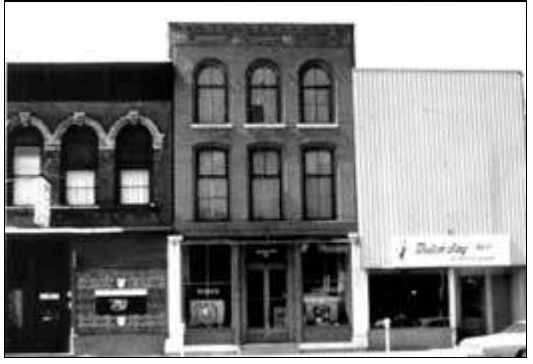
This photograph shows the impact of preserving historic storefronts. The one on the right has been totally obscured by a "modern" front added in the 1950s.

1. Scale: Respect the scale and proportion of the existing building in the new storefront design.