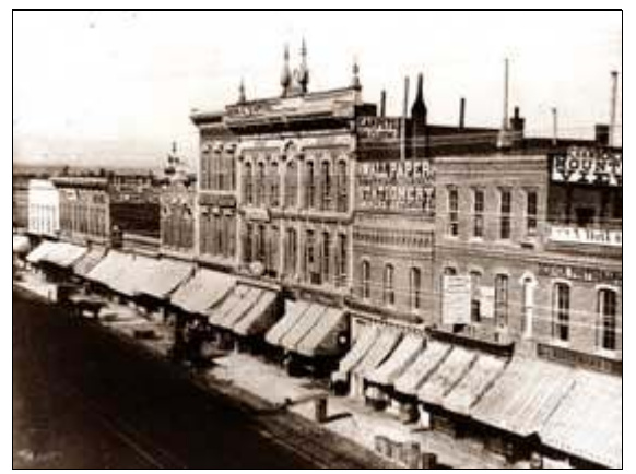
Try to locate old photographs or prints to determine what alterations have been made to the storefront and when they were undertaken. Awnings were common elements of storefronts at the turn of the century.

of metal shelf angles bolted to the walls on three-foot centers. Joints between the panels were filled with cork tape or an elastic joint cement to cushion movement and prevent moisture infiltration.