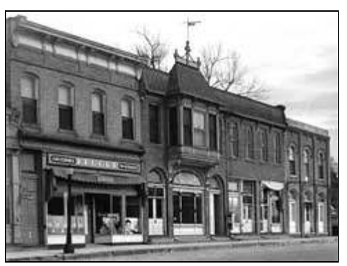
By evaluating the components of a storefront as well as their existing condition, a successful rehabilitation is more likely.

Are the entrances centered? Are they recessed? Is one entrance more prominent than the others? How is the primary retail entrance differentiated from other entrances? Is there evidence that new entrances have been added or have some been relocated? Are the doors original or are they later replacements?