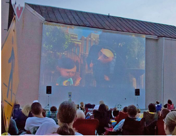
Outdoor movies in the summer presented by Main Street Greenville, Ohio.