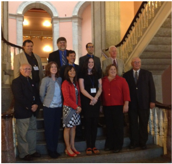
Speakers from Heritage Ohio's Appalachia Heritage Luncheon, honored the unique cultural efforts in the Appalachian region. This annual luncheon is held in partnership with Ohio's Hill Country Heritage Area.