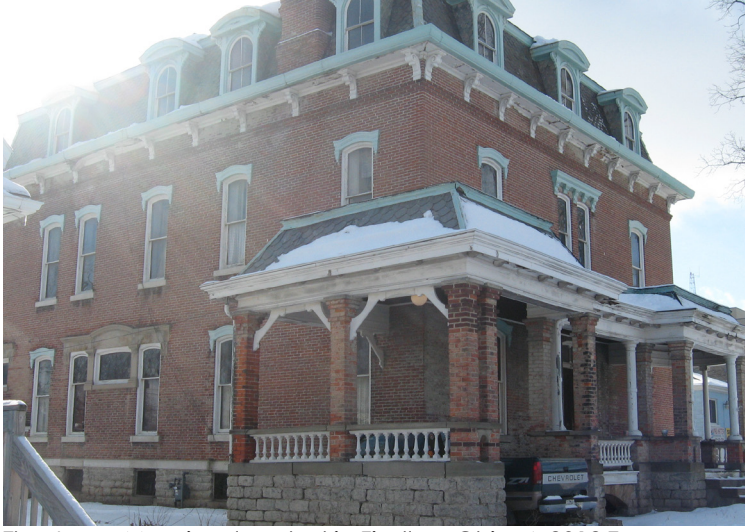
The Jones Mansion, located in Findlay, Ohio. A 2012 Top Opportunity is now making use of historic tax credits.