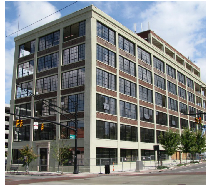
Julian Building located in Columbus, Ohio, a new easement accepted in 2013.

For more information on Historic Preservation at Heritage Ohio contact: