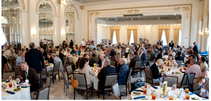
Heritage Ohio's annual conference: Local Spirit was held from May 21-23, 2013 in Columbus, Ohio.