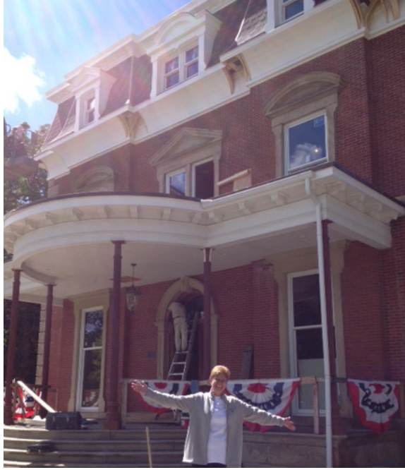
A visit to see the progress on the Steele Mansion in Painesville, Ohio, an Ohio historic tax credit project.