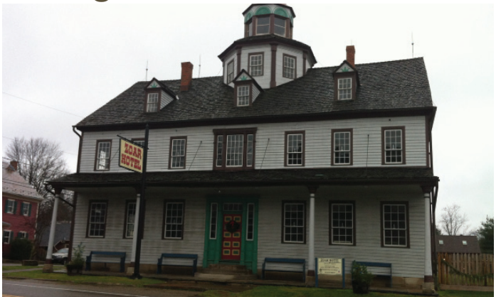
Saving Historic Zoar

Historic Zoar, a National Trust Most Endangered Property and a Heritage Ohio Top Opportunity. We are happy to announce Zoar's future is assured. The levee will be repaired!