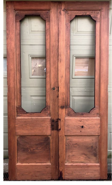
Original door stripped of paint.

For Halverstadt, historic integrity is key. She believes that using replacement doors or windows will take the character away. Even small details can make a big difference. Using the correct mortar mixture, for instance, changes the way a