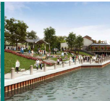
Oak Harbor Development Group Riverfront Rendering