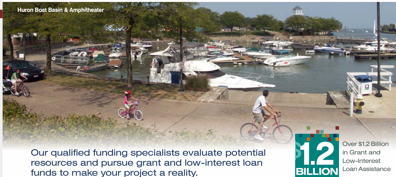
Huron Boat Basin & Amphitheater

Our qualified funding specialists evaluate potential resources and pursue grant and low-interest loan funds to make your project a reality.