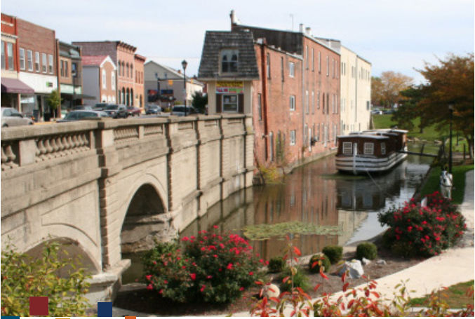
Miami-Erie Canal Tourism Plan