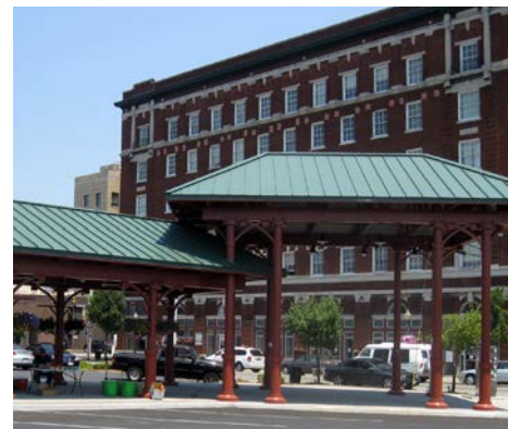
Ironton Downtown Depot Square Improvements

Our team of funding specialists have helped communities secure more than $1.2 Billion in grants and low-interest loans and are uniquely qualified to evaluate potential resources and pursue grant and low-interest loan funds, as well as other incentives. We not only help get projects funded, we help administer those funds as well. Our client-focused service has resulted in mutually beneficial, ongoing relationships with more than 800 communities, organizations and industries.