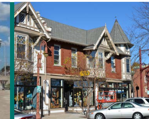
Maumee—Artcrest Building Renovations