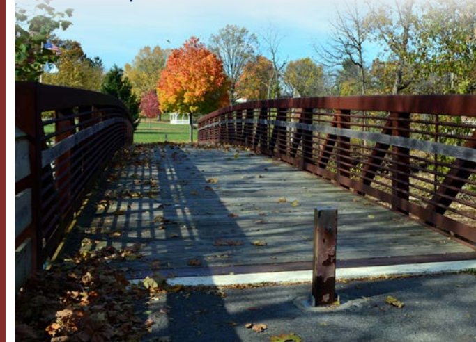
Upper Sandusky Stepping Stones & River's Edge Parks