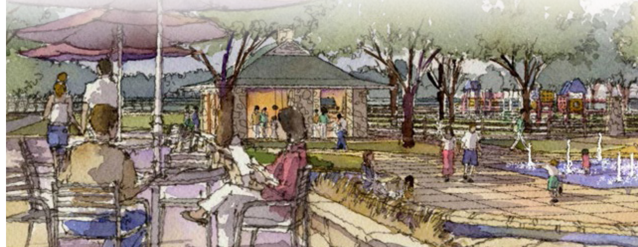
Whitehouse Parks & Recreation Master Plan