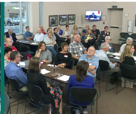
Wadsworth Community Branding & Wayfinding Plan