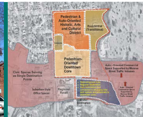
Sylvania Downtown Urban Design Plan