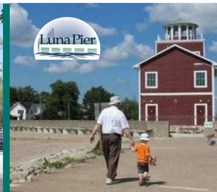
Luna Pier, MI Masterplan Implementation —Outstanding Comprehensive Plan Award