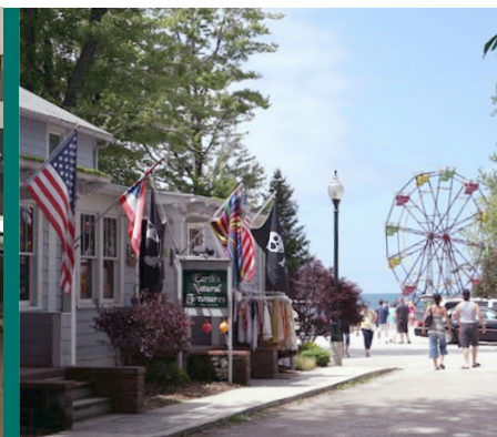
Geneva-on-the-Lake Revitalization Plan Main Street Downtown Planning Principles