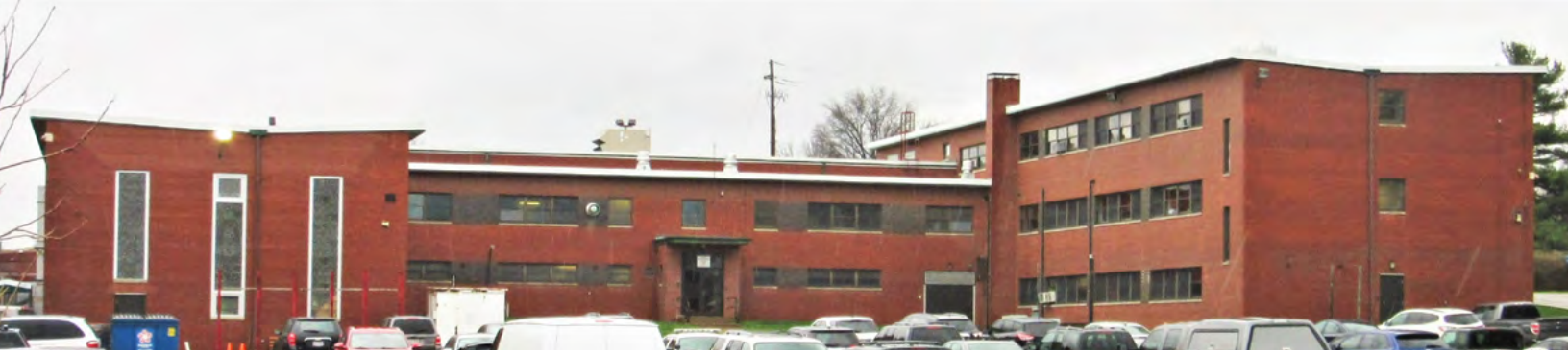
The main Reserve Training Building, constructed in 1956