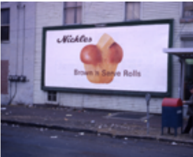
A major Downtown Wooster street prior to the Main Street Program!