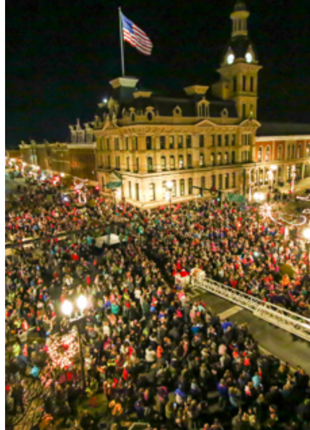
Window Wonderland 2017, the culmination of 30 years! People, People, People!

Main Street Wooster celebrating 30 years of a continuous program. City of Wooster creates two Welcome to Downtown Wooster major entries. City of Wooster completes wayfinding signage in the downtown.