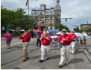
New Orleans-style parade at the Wooster Arts Jazz Fest

partnership plans for an infill project of condominiums and retail. D5L Liquor License: state legislation initiated by Main Street Wooster. A milestone for economic development of entertainment and dining in small Ohio downtowns. A local developer purchases downtown buildings for renovation; retail and restaurants.