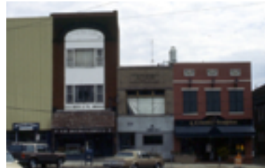
The beginning; the building on the far right, one of the first rehabilitation projects in the downtown.

All-American Main Street Award to Main Street Wooster by National Trust for Historic Preservation. Downtown Wooster information kiosk installed on the square. 1 hour FREE parking in three quadrants of Public Square. $1M additional monies allocated, by City Council, for continuation of infrastructure and streetscape on East Liberty.