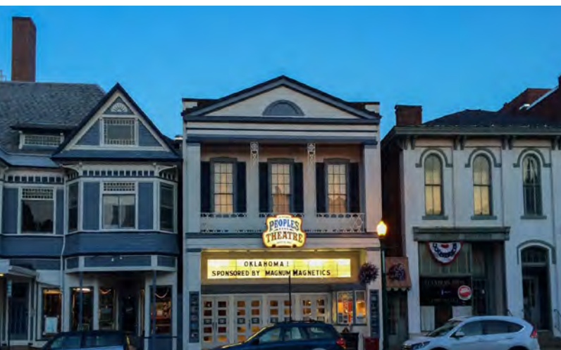
Peoples Bank Theatre

The Carlisle Building's extensive restoration made use of both Ohio and federal historic preservation tax credits. The building now houses corporate office space on the first floor. The second, third, and fourth floors house a total of 32 residential units for Adena Health System's medical students and staff. The Carlisle Building, once again, is the "jewel" of downtown Chillicothe.