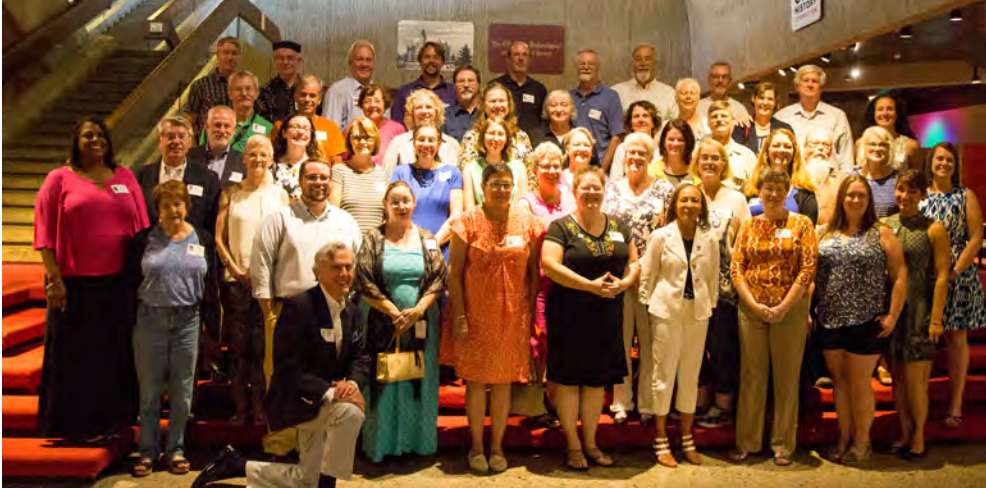
Ohio's State Historic Preservation Office staff past and present gathered for a reunion in August 2016