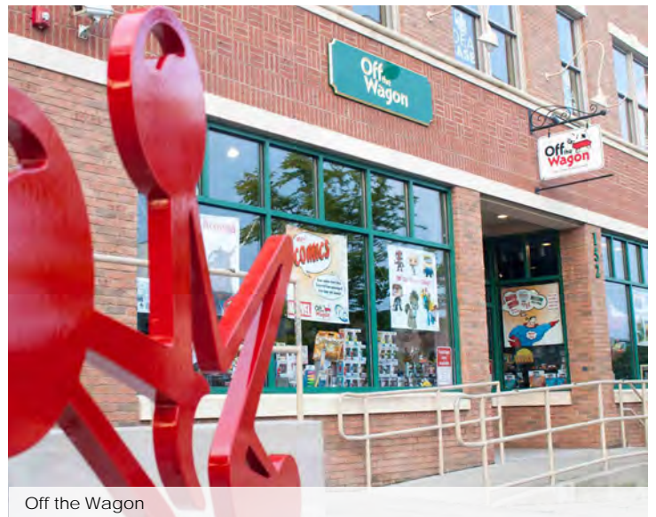
Off the Wagon

For more information, visit offthewagonshop.com