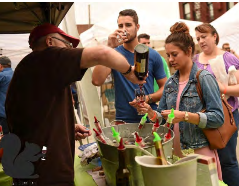
Main Street Kent Art & Wine Festival

For more information, visit peoplesbanktheatre.com