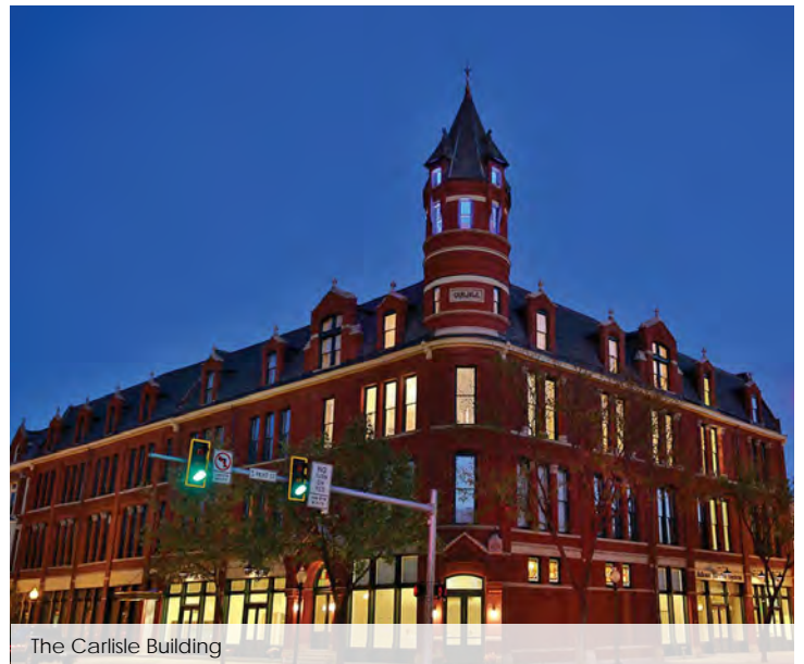
The Carlisle Building

For more information visit mainstreetmedina.com/renew-medina.html