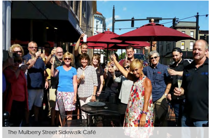
The Mulberry Street Sidewalk Café

This successful project was the first sidewalk café supported by a new Lebanon ordinance, and this pilot project has been warmly received for its improvement to sidewalk aesthetics and its ability to attract visitors to shops. The project has resulted in increased pedestrian traffic, an improved quality of life in downtown Lebanon, and has established sidewalk café design criteria and guidelines for future sidewalk cafés.