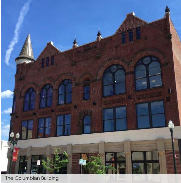
The Columbian Building