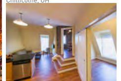
Pictured: the Carlisle Building in Chillicothe, OH

The beautiful, enduring structures we create for government, education, cultural and other public and private clients are inspired by the people that interact with them where they live, learn, work and play.